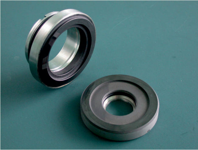
Uszczelnienie mechaniczne: BWTUCH 21mm BW1EGG