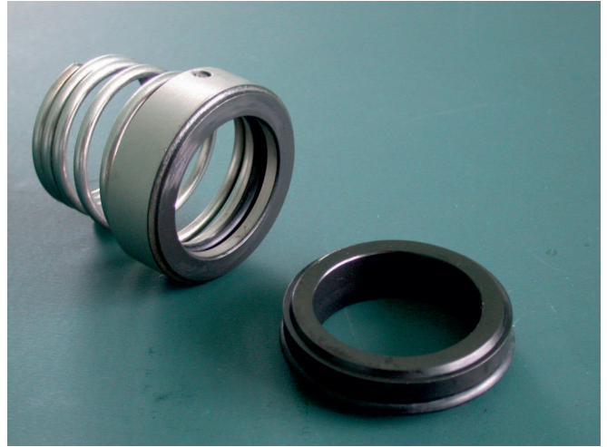
Uszczelnienie mechaniczne: KU/GG6 028 W1BEGG L1K